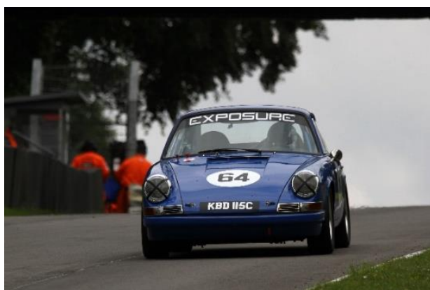
Class D - Roger Sparrow