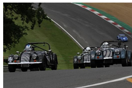
(The plus 8 show!!)