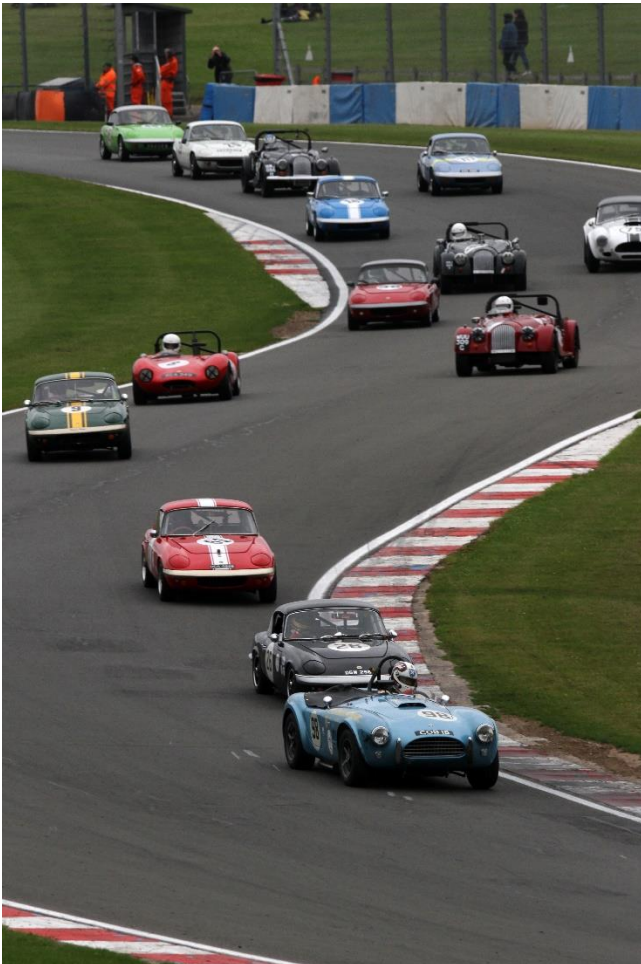
The Cobra of KeKi took the lead, down the Craners; however, it was not to last