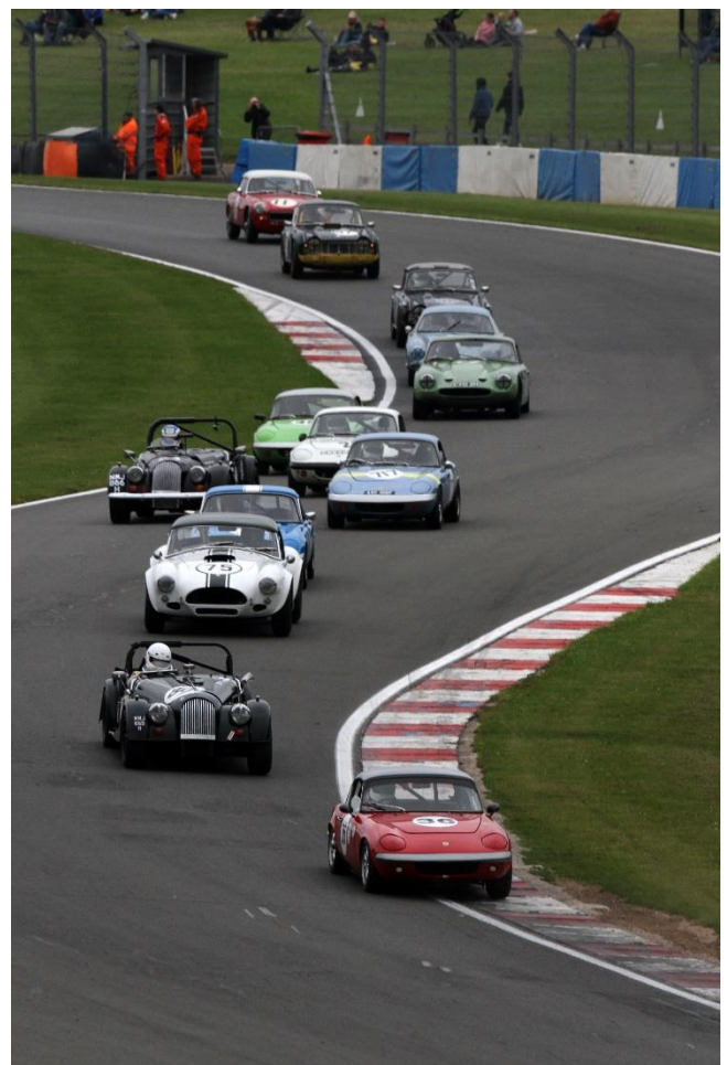
Superb lines from Frazer in the red elan