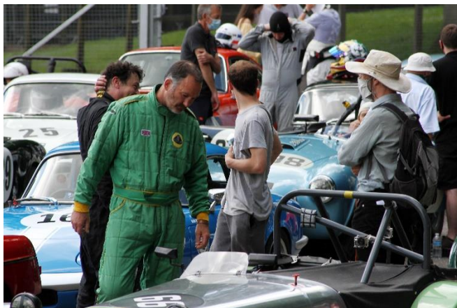
Ah.... there you are!