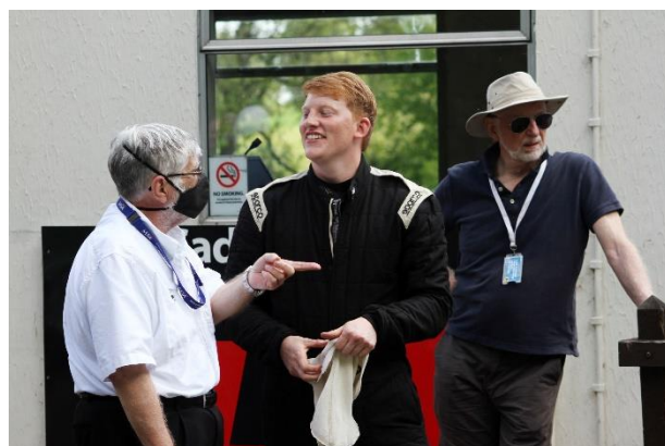
Mask? What mask? I am a driver don't you know!