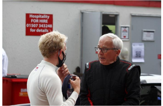
A Morgan strategy meeting