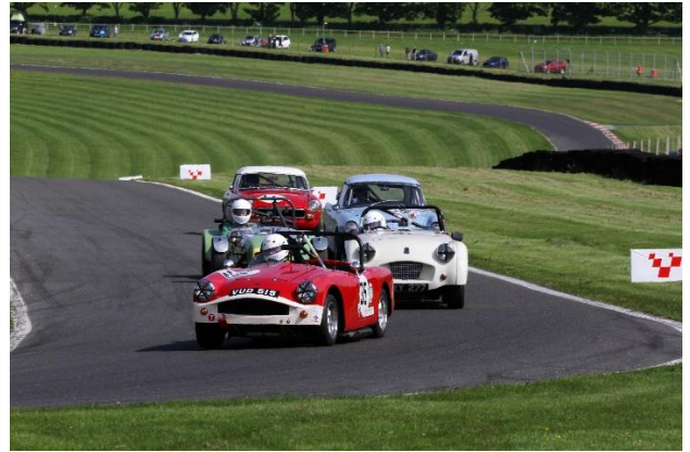
Close battles on both days all through the grid.... just brilliant!