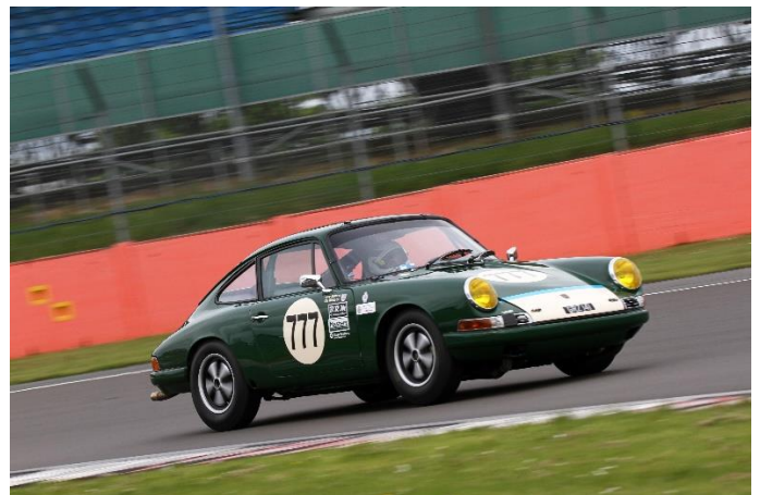
Guy Ziser qualified the FIA spec Porsche in P24 and finished in P17