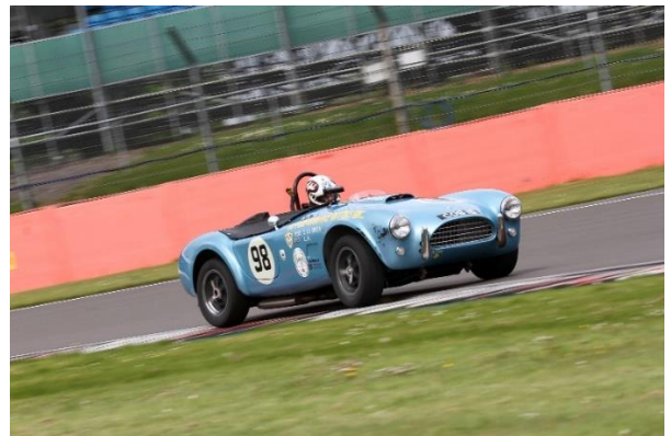
The KeKi Cobra, going the right way around the circuit!