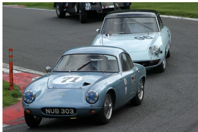
Pretty in blue