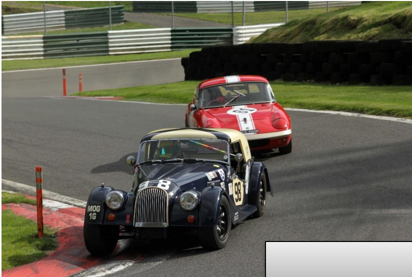
Toomsie gives chase