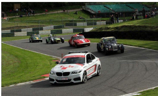
Super-fast pace car lap spread the field very thinly for race two, giving KeKi a 41 second delta to catch up