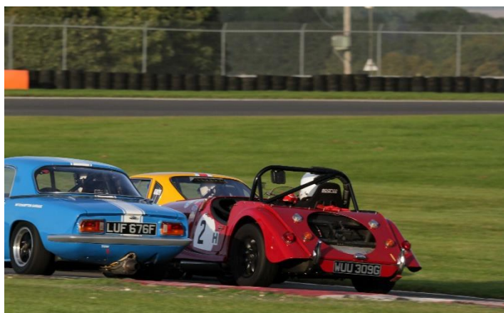
Now that is a tight squeeze!

It makes you think, doesn't it? We had a fabulous and varied grid for the Wolds Trophy weekend at Cadwell with the largest field for many years with 28 cars in all, almost twice that of our grid last year, so a huge thank you to everyone who supported the HRS.