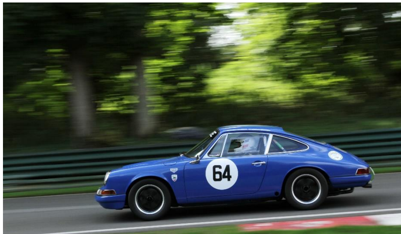
Roger Sparrow's very pretty 911