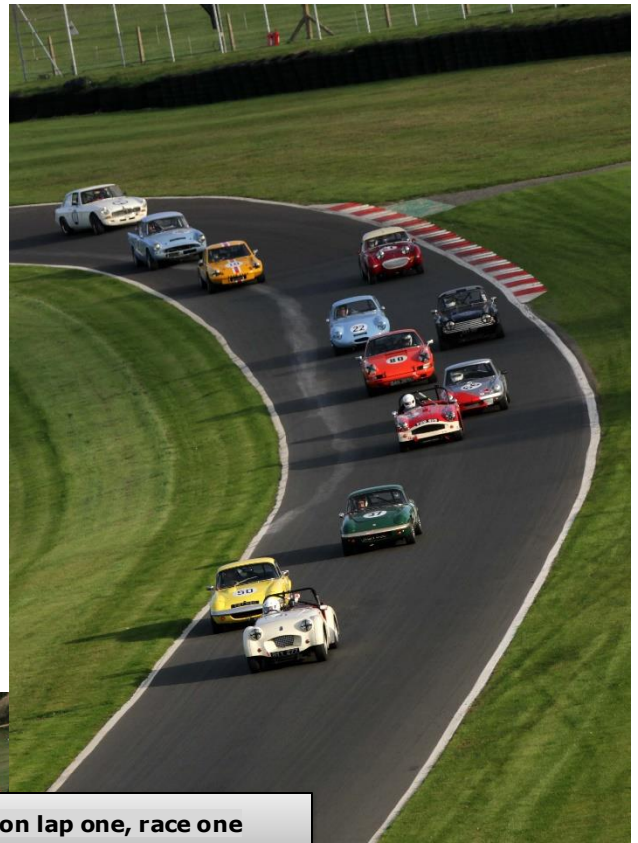
The 28-car grid set off on lap one, race one