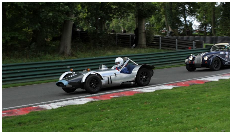
A rare sight, a Terrier Mk2