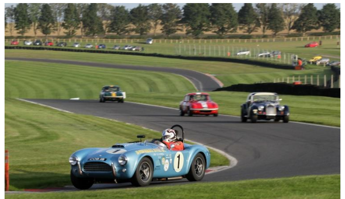
The KeKi Cobra took the lead, but not for long