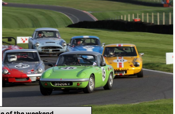
Another close battle of the weekend